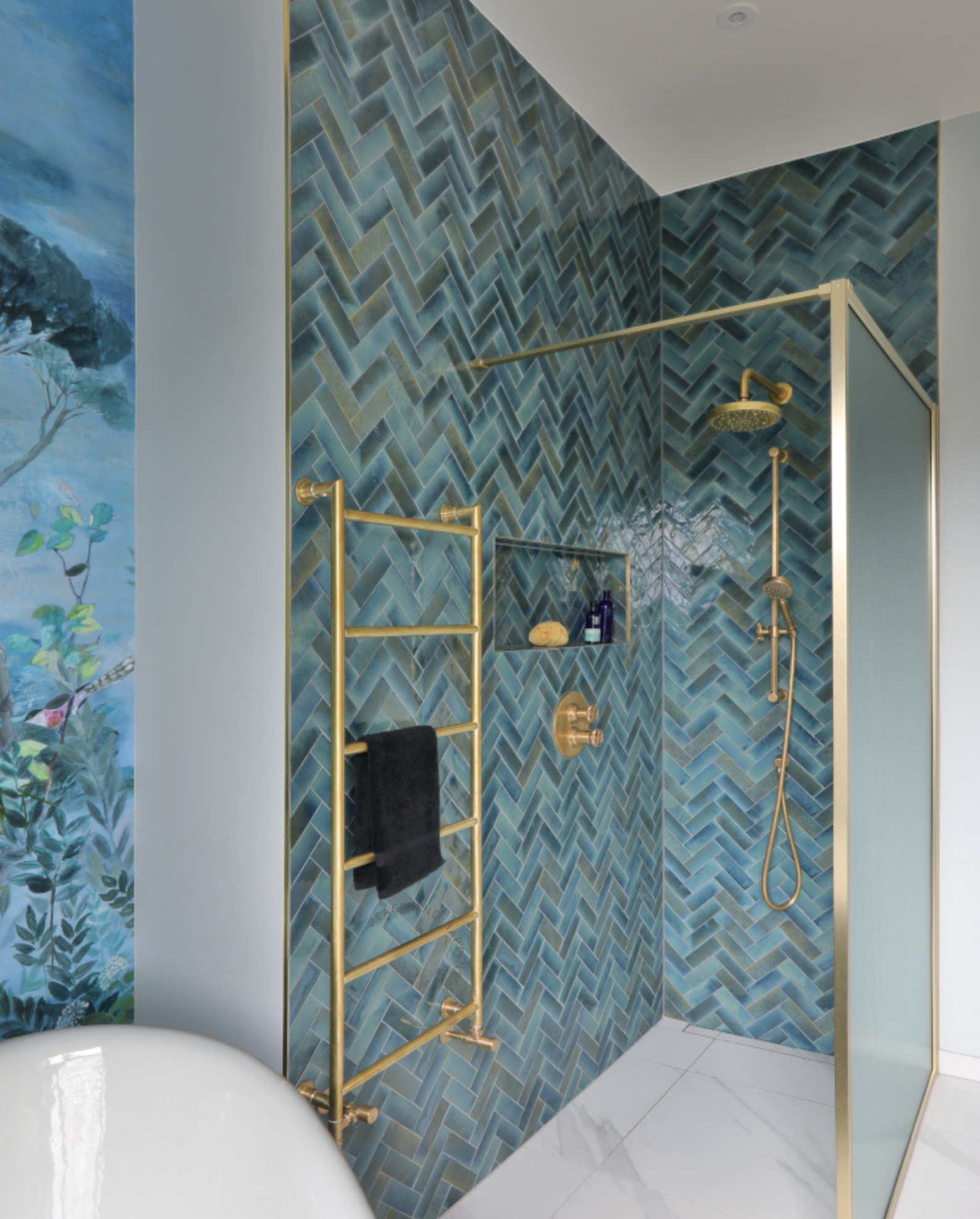
An outside, fluted glass shower screen sits flush with the floor to create a walk-in shower